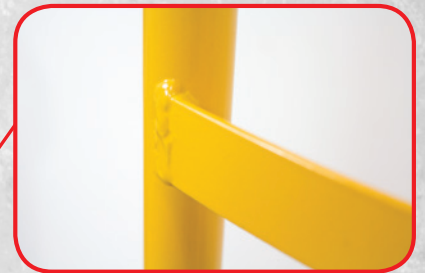
HIGH QUALITY WELDS