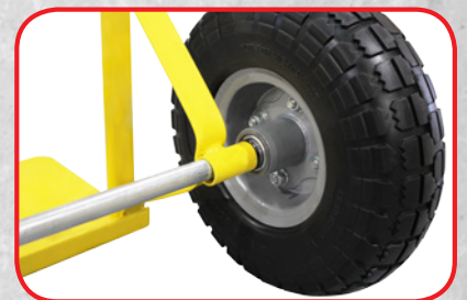
PF1072 ECONOMY PUNCTURE PROOF WHEELS