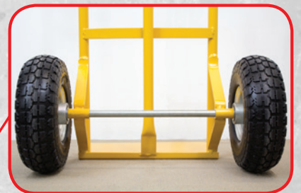
THICK REINFORCED AXLE