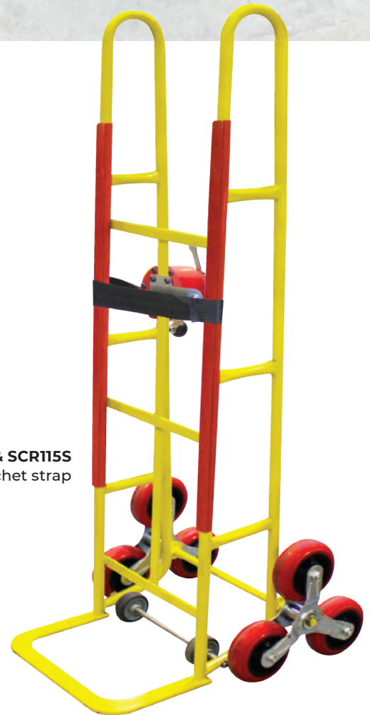
SCR116 Stair Climber Replacement Wheel