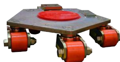
12 TONNE MECHANICAL SKATE DOLLIE 600SKATE5-12TON